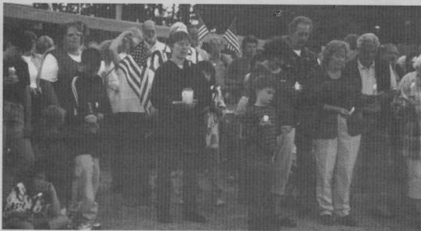
A gathering of about 200 people gathered at Key Center to honor and mourn those lost to the September 11th attacks in New York and Washington, D.C. More Vigil photos on Page 14.

The Civic Center was recently notified that the Russell Family Foundation has donated $5,000 to the Civic Center's Grant Fund. This grant, together with the funds donated by the Key Peninsula's Angel Guild, has enabled the Civic Center Board of Directors to embark on the interior renovation of the gymnasium, which will include the repair and painting of the ceiling and the painting of the gym itself. The Board is deeply appreciative of the Russell Family Foundation's support.