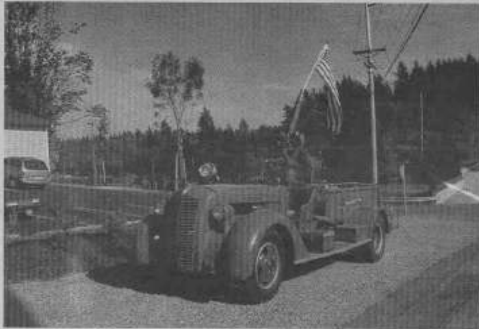
At Home, the old Fire Truck with OUR FLAG flying makes a dramatic statement on September 13, 2001.